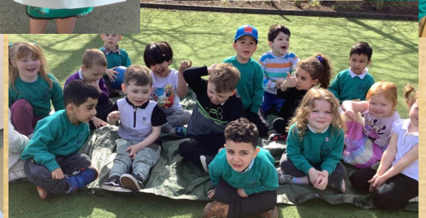
Enjoying story time outside 😊